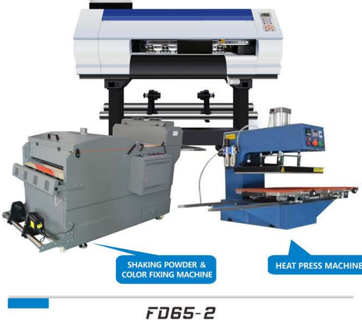
SHAKING POWDER & COLOR FIXING MACHINE