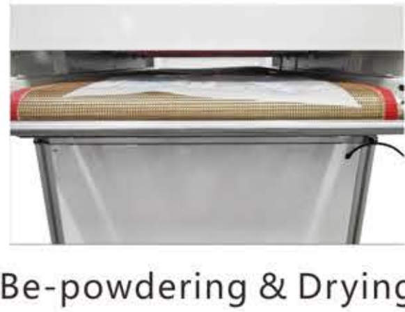
Be-powdering & Drying